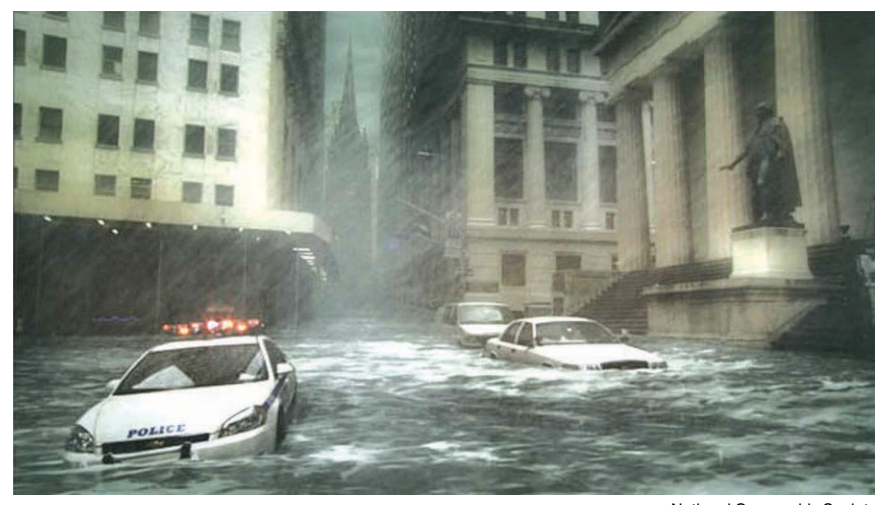
National Geographic Society

Univelt, Inc., P.O. Box 28130, San Diego, CA 92198, USA Tel.: (760) 746-4005; Fax.: (760) 746-3139 E-mail: 76121.1532@compuserve.com Web Site: www.univelt.com